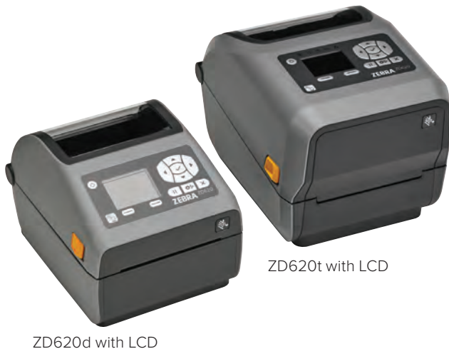
ZD620d with LCD

When print quality, productivity, application flexibility and management simplicity matter, the Zebra ZD620 delivers. As the next generation in Zebra's desktop printer line, the ZD620 replaces Zebra's popular GX Series and ZD500 printers, rising above conventional desktop printers with premium print quality and state of the art features. Available in both direct thermal and thermal transfer models, as well as healthcare-specific models, the ZD620 meets a wide variety of application requirements. It offers the most standard features of any Zebra desktop printer, including an optional 10-button user interface with a color LCD that takes all the guesswork out of printer setup and status. The ZD620 runs Link-OS® and is supported by our powerful Print DNA suite of applications, utilities and developer tools that deliver a superior printing experience through better performance, simplified remote manageability and easier integration. The Zebra ZD620 — delivering the print speed, print quality and printer manageability you need to keep your operations moving forward.