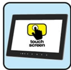
[ GFC Series ]