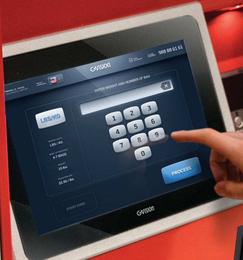
17 Inch / Open Frame PCAP Touch Monitor