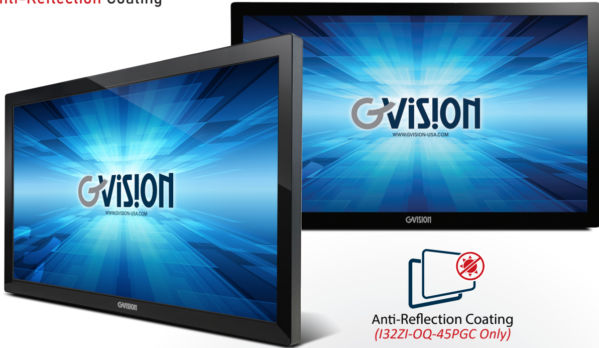
Anti-Reflection Coating (I32ZI-OQ-45PGC Only)