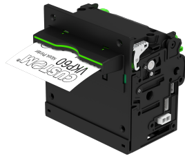
915NA020100300 PRINTER VKP60 USB RS232 PAPER MOUTH