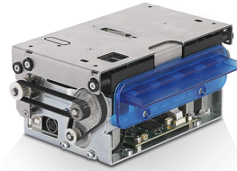
993LV010500200 SCANNER A6 FRONT REAR MSR ULTRASONIC

CUSTOM SPA - Via Berettine, 2 - 43010 Fontevivo PR - VAT: IT02498250345 - TEL: +39 0521 680111 - FAX: +39 0521 610701 - UNIQUE CODE: T180W10