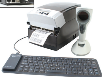
C Series-- A perfect standalone application