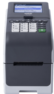
TD-2350DSA USB, Serial, Ethernet, Wi-Fi® & Bluetooth®