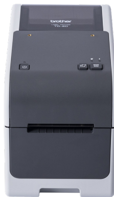
TD-2320D USB, Serial & Ethernet