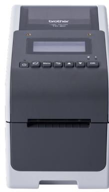
TD-2350D USB, Serial, Ethernet, Wi-Fi® & Bluetooth®