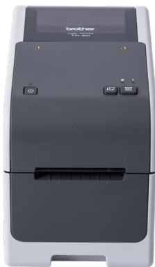
TD-2310D USB & Serial